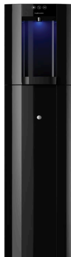
Borg & Overström E4 with base cabinet