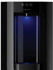
Borg & Overström E4

The dispenser size and versatility will allow for application in a wide variety of customer types and locations, particularly when competitive pricing is concerned.