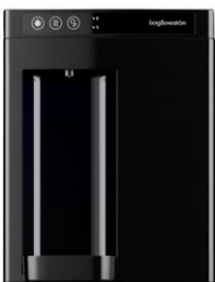
Borg &amp; Overstrom B4

The dispenser size and versatility will allow for application in a wide variety of customer types and locations, particularly when competitive pricing is concerned.