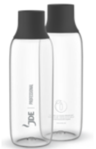
Wave bottle design

BRITA offers a few installation options; base cabinet, base plate and a waste water tank. Next to this we have 2 types of bottles in our portfolio. Same design, but different material type, either glass (750ml) or durable plastic (600ml). The glass bottles serve more the purpose as a bottle to take into meeting rooms or place on your desk, while the durable plastic ones are more for personal use and for on-the-go. The two material type bottles can be customized with a logo in one colour.